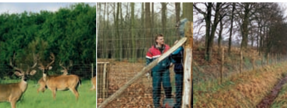
Ursus Heavy AS